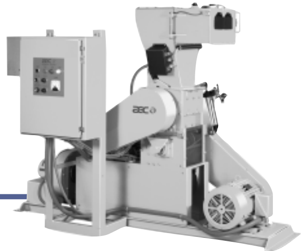
Model GR2-812-20 HBD

AEC's exclusive HBD® film grinders use dual cutting chambers to reduce the fluff to a smaller particle size, providing a higher bulk density, which results in higher re-feed rates. Scrap film first passes through a primary upper cutting chamber, then through a secondary lower chamber with a smaller screen. HBD® grinders are excellent for tacky, heat-sensitive materials, like LLDPE and PVC. HBD® Series grinder design permits a very high line speed edge trim, because the top chamber stays evacuated to enable efficient ingestion of materials. Excellent for high-speed cast film lines.