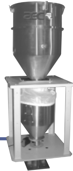
GH/GH-M Series Extrusion Control Unit

The GH extrusion control and GH-M extruder rate monitor units match the extruder throughput, track material usage, and can control extruder output with the optional control system